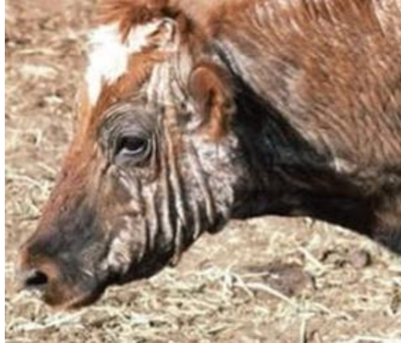
An image of a cow with mange in the head and neck.