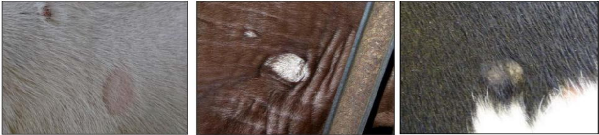
Above are examples of lesions that are unacceptable.