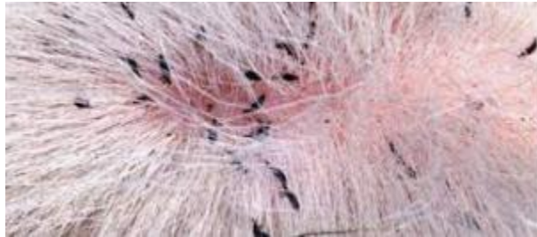
Lice present in the hair of a calf.