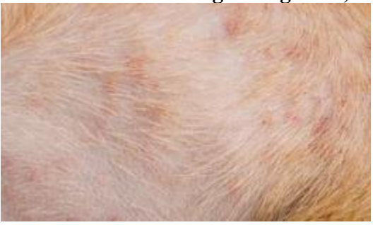
This lesion would be acceptable as there is hair growth in the middle of the lesion.

NOTE: Animals that have had ringworm may be accepted if the ringworm is NOT ACTIVE. The treatment for ringworm is effective but lesions can take a long time to heal.