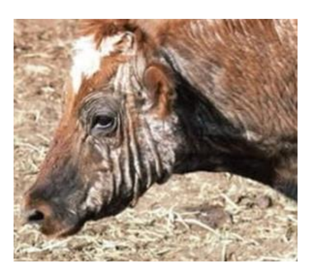
An image of a cow with mange in the head and neck.

a) Animals with mange must not be shown.