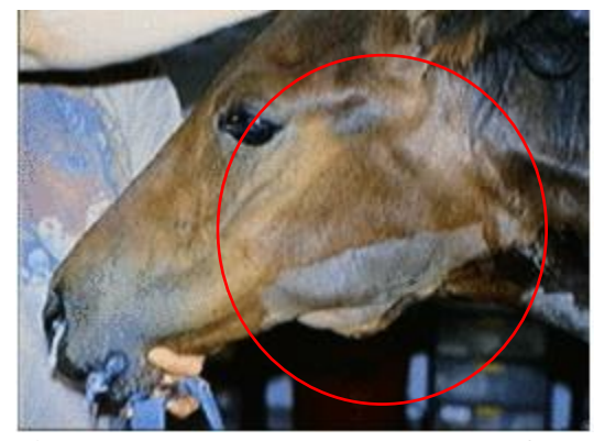
An image of a horse with swollen lymph nodes around face (inside the red circle).