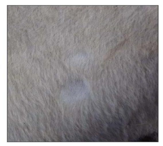
Above are examples of acceptable lesions – hair is growing back, and skin is not crusty looking.