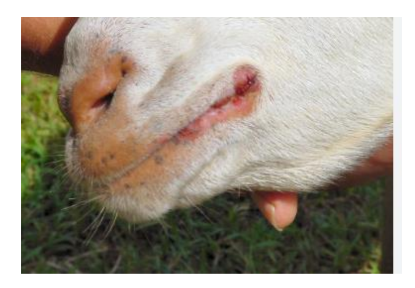
An image of a goat with orf.

a) Since it is a highly contagious disease, animals who exhibit symptoms of "orf" will not be permitted to show.