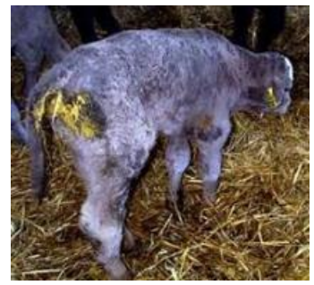
An image of a calf with diarrhea.