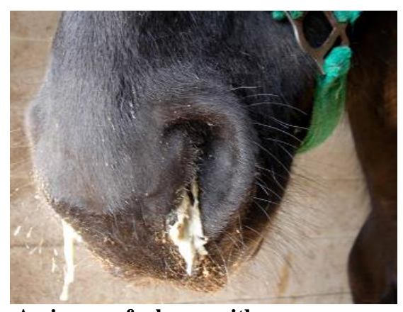
An image of a horse with a runny nose.