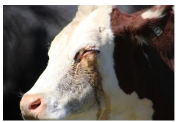
An image of a cow with a runny eye suggestive of pinkeye.

a) Animals with pinkeye must not be shown.