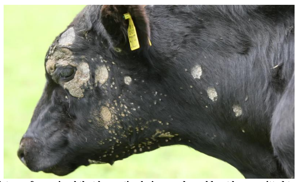
Above is a picture of an animal that has active lesions and would not be permitted to show.

b) animals that have lesions that are small to moderate in size (<2.5 cm in diameter, the size of a toonie), has hair regrowth occurring within the lesion and the skin is not crusty, scabby, or irritated looking will be permitted to show.