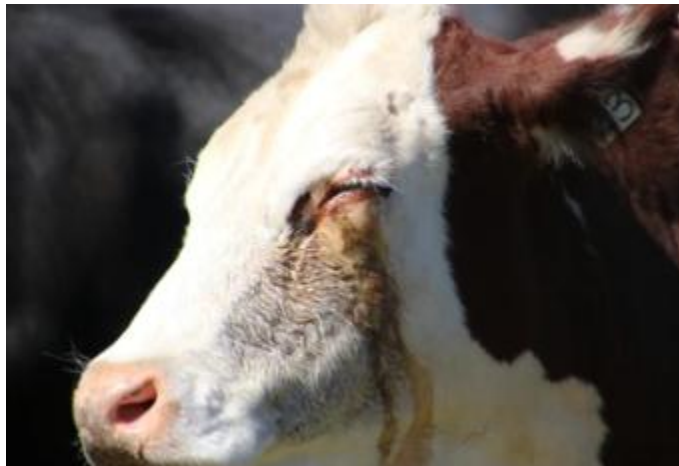
An image of a cow with a runny eye suggestive of pinkeye.