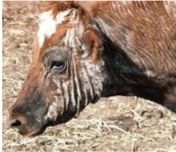
An image of a cow with mange in the head and neck.