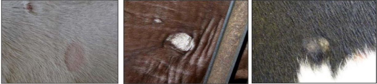
Above are examples of lesions that are unacceptable.