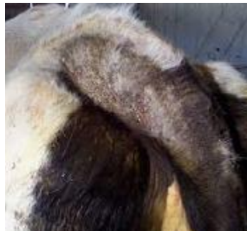
An image of a dairy cow with tailhead mange.