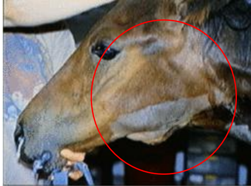
An image of a horse with swollen lymph nodes around face (inside the red circle).