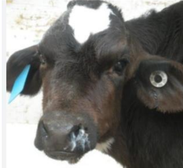
An image of a calf with pneumonia.