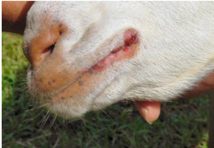
An image of a goat with orf.