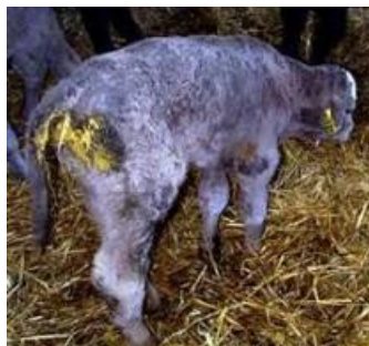
An image of a calf with diarrhea.