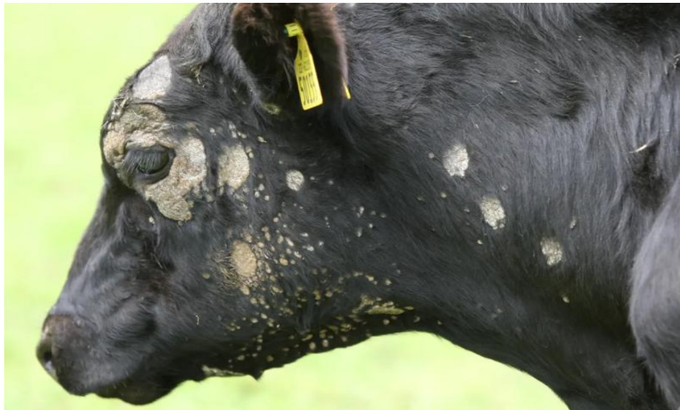
Above is a picture of an animal that has active lesions and would not be permitted to show.